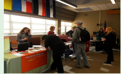
BCC/Attleboro Transfer Fair 2013

Should you decide to transfer, our transfer counselors can help you meet the requirements of the four-year institution of your choice. Refer to the catalog section called Transferring or check the transfer website for information about services and articulation agreements with other colleges.